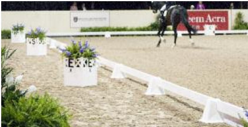
Sundance Arena featured at the 2015 FEI Reem Acra World Cup Dressage Finals™

Storage: Wash sand off rails to prevent scratching. Rails must lie flat on a smooth, flat surface. Cones should be clean and free of sand and debris before stacking.