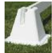
Cone troughs face inside of arena so rails are close to the track.