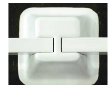
Cone troughs face inside of arena so rails are close to the track.