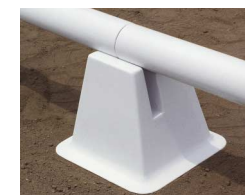
The Wellington Arena accommodates 3.5" round rails