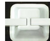
Cone troughs face inside of arena so rails are close to the track.