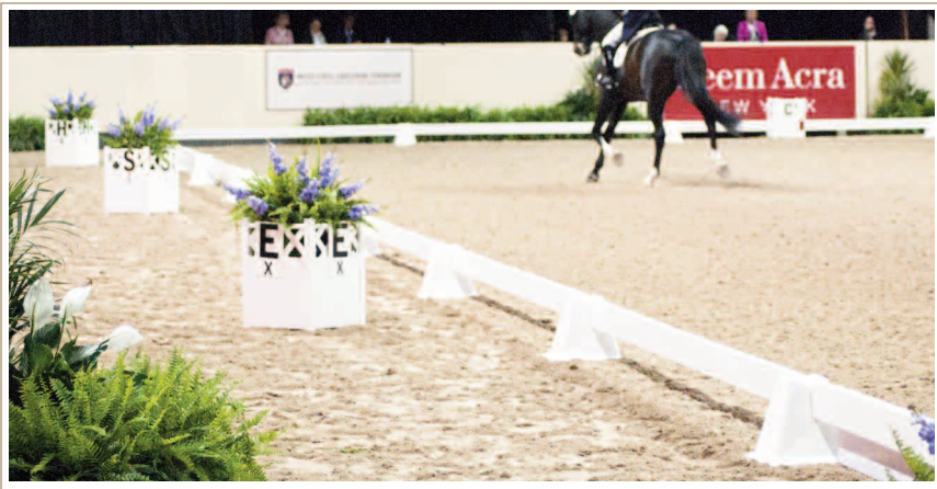
Sundance Arena featured at the 2015 FEI Reem Acra World Cup Dressage Finals™

Storage: Wash sand off rails to prevent scratching. Rails must lie flat on a smooth, flat surface. Cones should be clean and free of sand and debris before stacking.